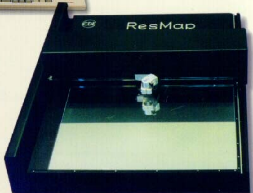
ResMap 188 (550mm x 685mm)