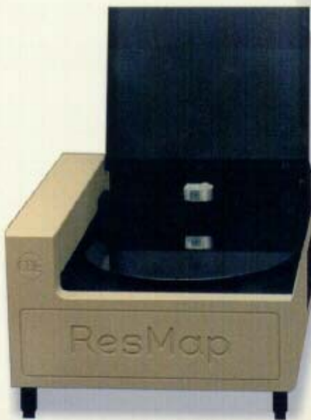
ResMap 273 (300mm)